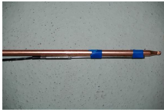
Reference temperature sensor