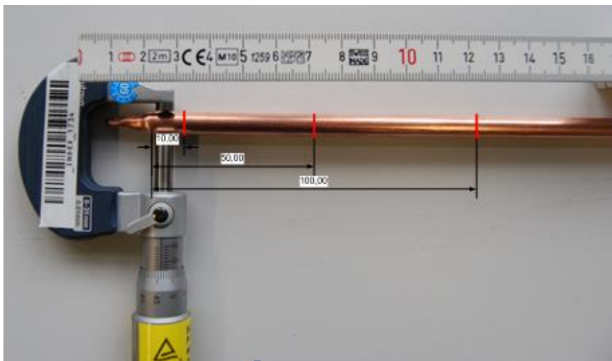
Fig. 1: Definition of initial positions for diameter determination [mm]

Besides retaining some (conditioned) heat pipes for comparative measurements (also necessary for heat pipes integrated into single glass tubes), the initial measurement should be done at precise defined positions like suggested in the following picture. If there are heat pipes with cylindrical shapes of the fluid filled part, the point of measurement should be based on the coplanar area of the end of the tube. For conic shaped tubes, the comparative measurement between a pipe performing freeze test and one didn't performing the test, but going through the same preconditioning seems to be an applicable solution.