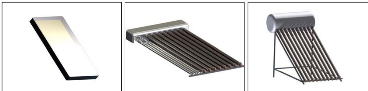
Flat Plate Collector

The European Solar Keymark, based on the norm EN 12975 for solar collectors and the EN 12976 for solar thermal systems, is the worldwide best developed quality label. It is not only in Germany (for the Renewable Heat Act and the Market Stimulation Program) required to get subsidies. The norm includes a definition for performance tests as well as for mechanical load tests to check the reliability of solar thermal collectors.